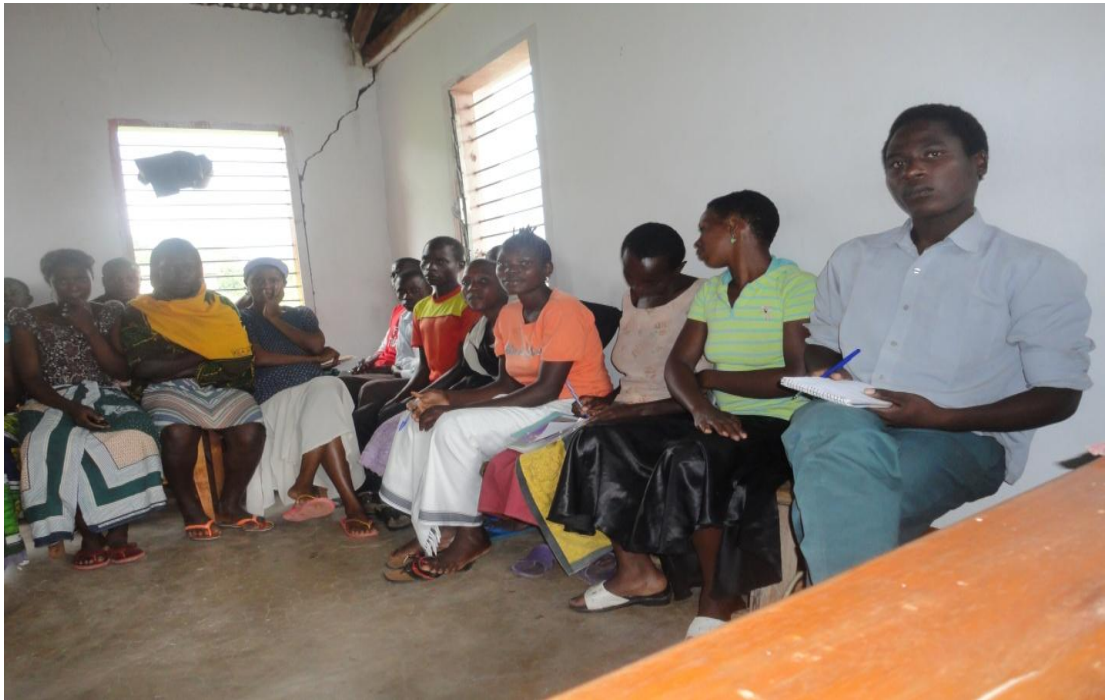
Figure 1: Youth During Focus Group Discussion