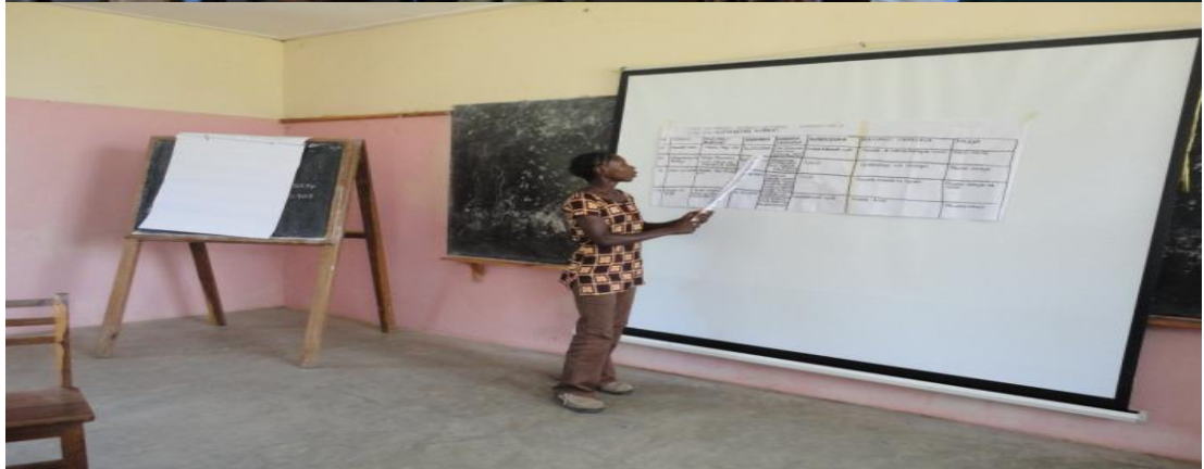
Figure 5: Entrepreneurship Training to Youth