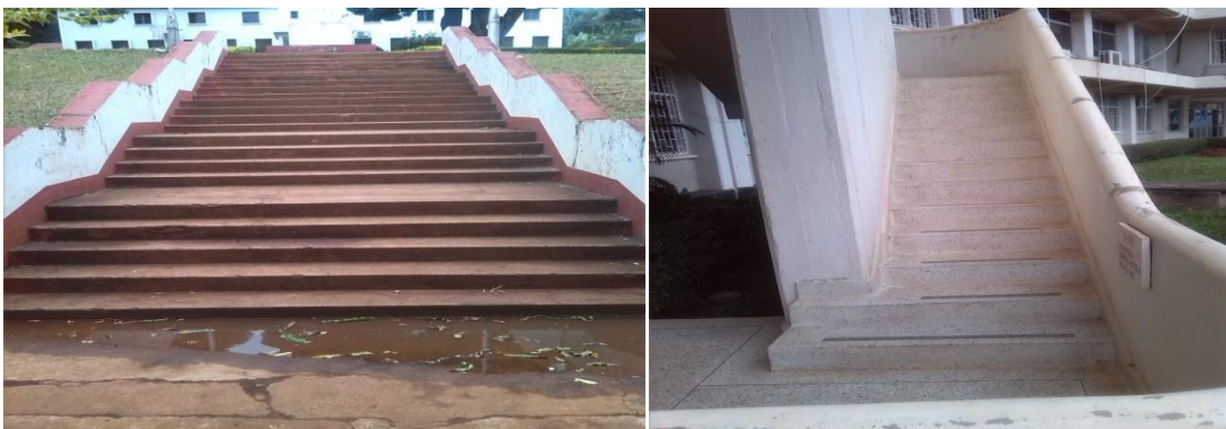
Figure 6: Unsupportive Infrastructures for Physically Disabled Students at Sampled Higher Learning Institutions in Morogoro Municipality.

It is advisable that all higher learning institutions have plans that all buildings and infrastructure such as classrooms, dormitories, dining halls, toilets and play grounds by considering people with disabilities like putting slopes, lumps and lifts in higher buildings so that every student in spite of his/her condition could move and make the use of any environment that are comparable to their needs easily.