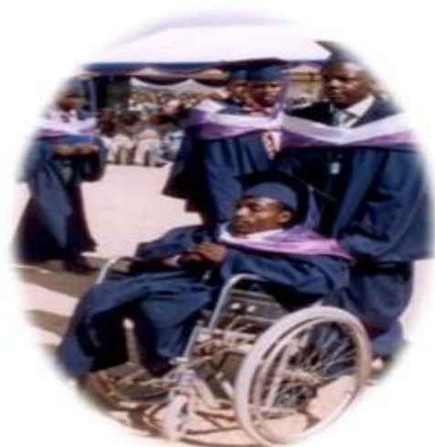
Figure 2: A Physically Disabled Student at St, John University of Tanzania, Dodoma, Tanzania, being assisted by his fellow graduates during graduation procession. http://www.sjut.ac.tz/sjut_fundrising.php