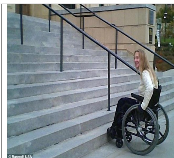
Figure 1: A Physically Disabled Person on a Wheelchair at the bottom of Stairs at the University of Utah, USA.