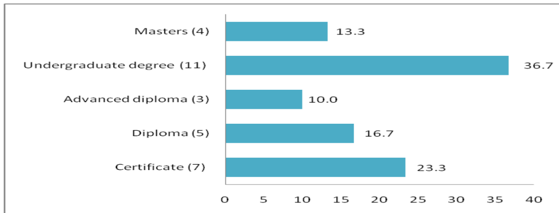
Figure: 4.1: The Highest Educational Qualifications

sustainability of SACCOS in the long run. Information on the highest level of education of respondents is presented in Figure 4.1.